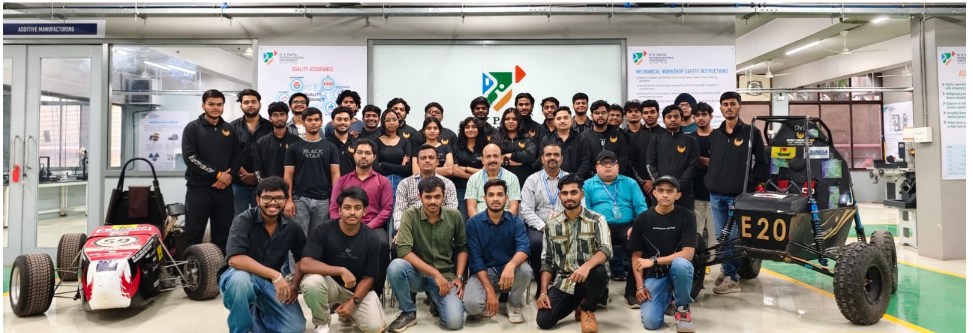
The entire team behind the scene along with their faculty