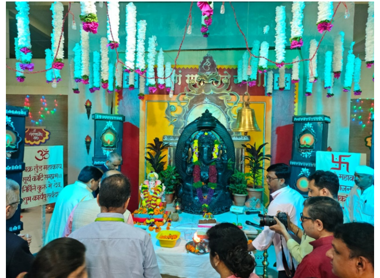
Ganesh Festival celebrated with piety and aplomb at DYPIU