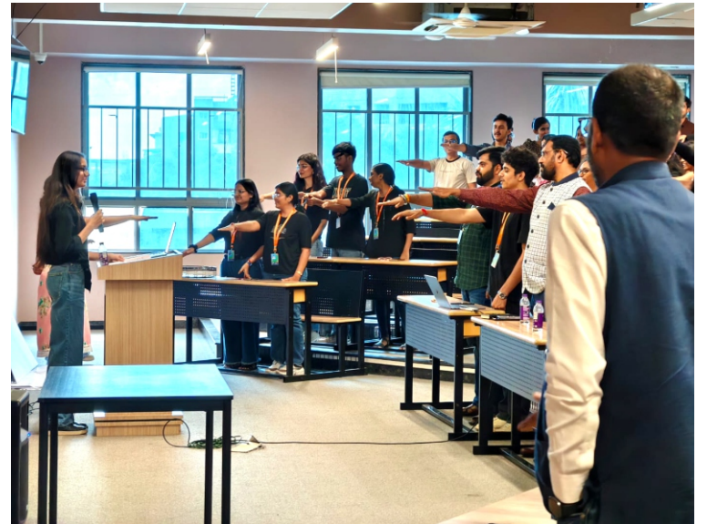
Taking the anti-ragging oath

And just when you thought it couldn't get more dramatic: boom—short film time. The movie and the talk that followed? Let's just say if you ever thought ragging was "just a joke," you're rethinking your life choices