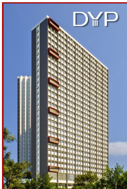
SECTOR 29, NIGDI PRADHIKARAN, AKURDI, PUNE - 411044, MAHARASHTRA, INDIA